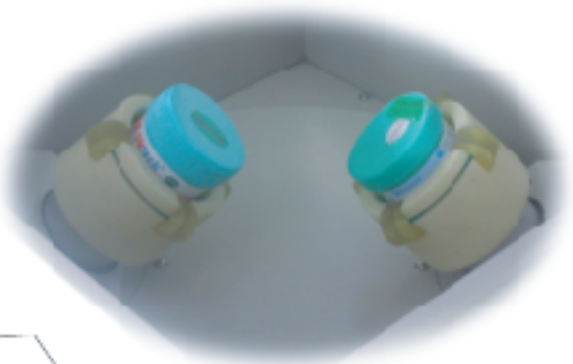
Jar housing selection guide